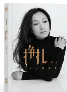
Ai Jing, a native of Shenyang, Liaoning province, is a Chinese contemporary artist whose fame started as a star singer-songwriter who has produced five albums of her own music as well as a number of EP albums and singles and she is also an accomplished artist. PHOTOS PROVIDED TO CHINA DAILY